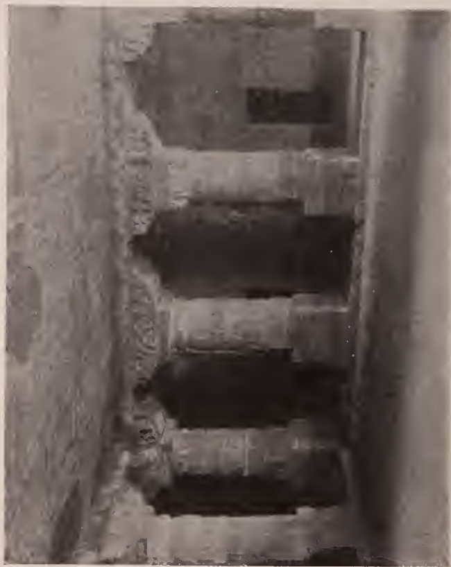
INTERIOR VIEW OF CAVE-TEMPLE AT AJANTA, INDICATING POSITION OF FRESCOS (SEVENTH CENTURY).